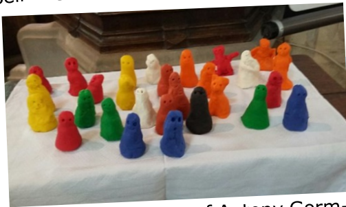
We tried to copy one of Antony Gormley's works in play dough during our All Age Worship in June