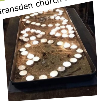
Candles for Remembrance