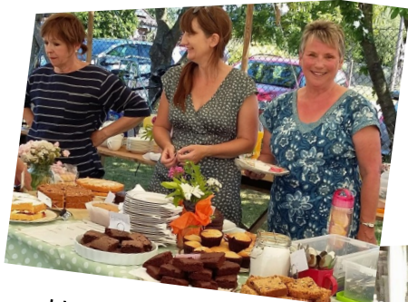
Little Gransden Church fete