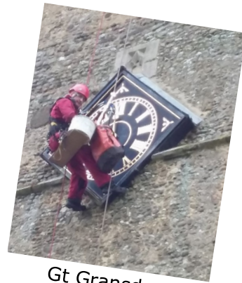
Gt Gransden Clock repairs in May