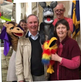
Mission in Puppetry