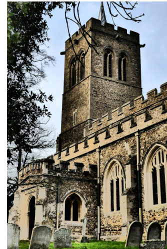
Gt Gransden - Jan 2019