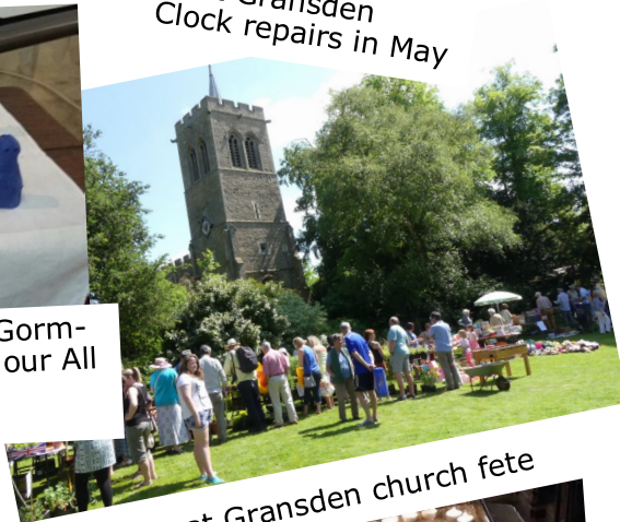
Great Gransden church fete